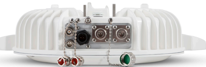
CFIP Lumina Optical

CFIP Lumina systems are intended for Gigabit Ethernet backbone applications delivering up to 366 Mbps per radio. 2+0 aggregation is available for higher bandwidth users. Both single or dual, electrical and fibre optical interface versions are available, as well as hybrid version with 1 optical and 1 electrical port.