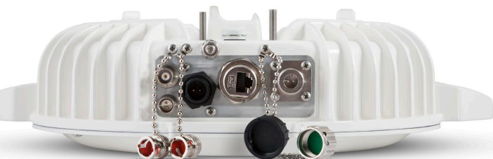
CFIP Lumina Hybrid

CFIP Lumina systems are intended for Gigabit Ethernet backbone applications delivering up to 366 Mbps per radio. 2+0 aggregation is available for higher bandwidth users. Both single or dual, electrical and fibre optical interface versions are available, as well as hybrid version with 1 optical and 1 electrical port.